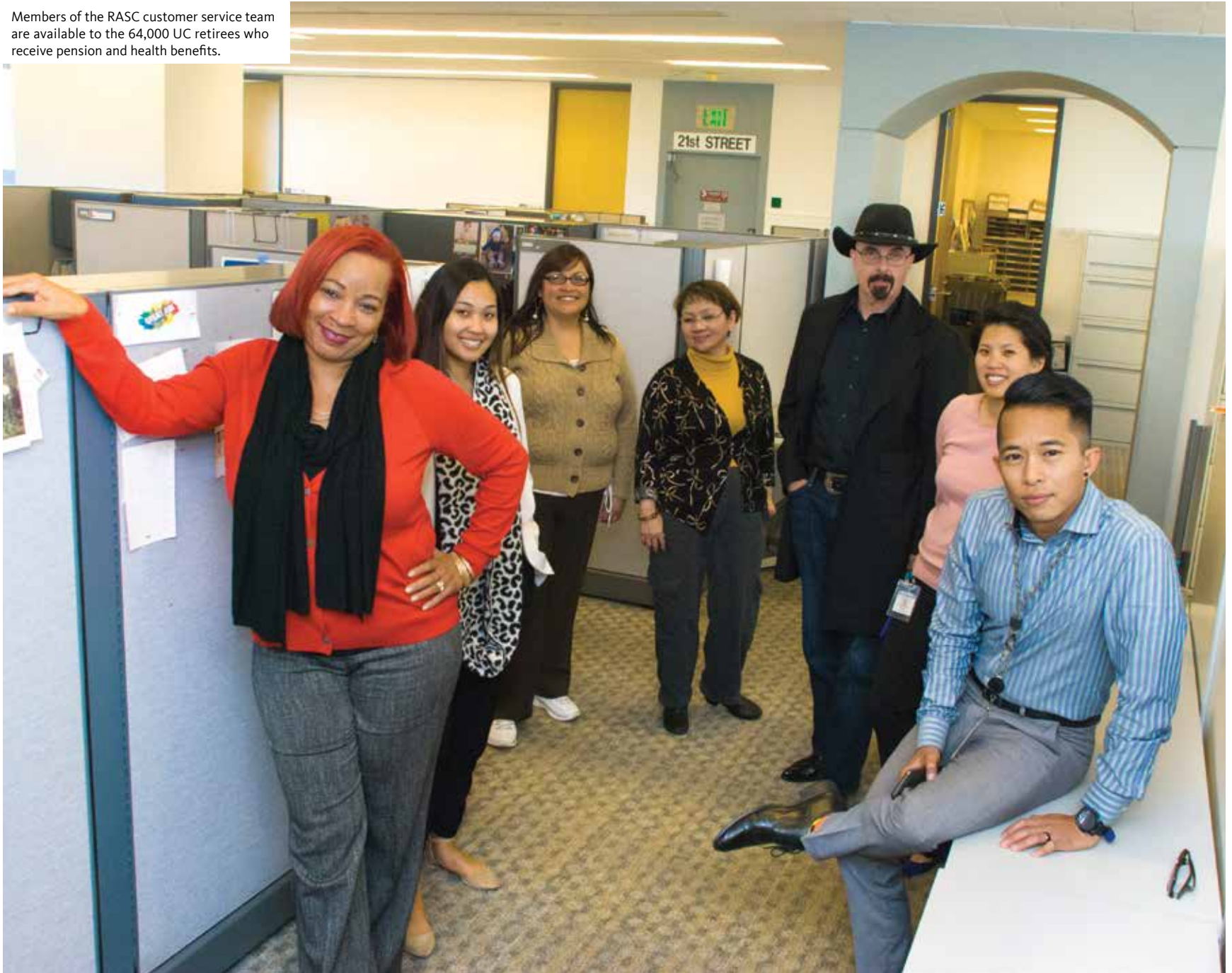
Members of the RASC customer service team are available to the 64,000 UC retirees who receive pension and health benefits.

service credit in the UC Retirement System in order to collect their benefits later.