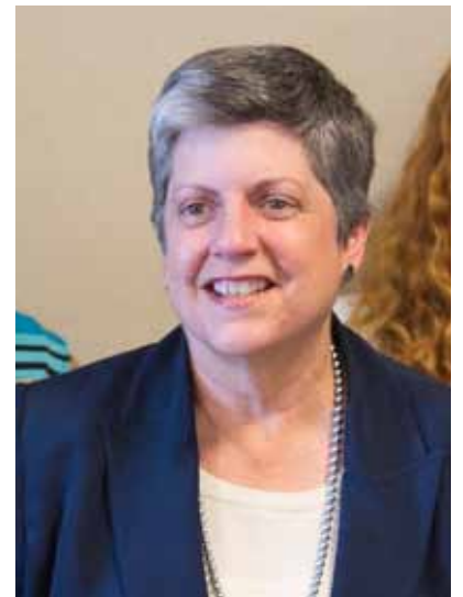
UC President Janet Napolitano

The University of California on Sept. 30 welcomed Janet Napolitano, former secretary of the U.S. Department of Homeland Security and twice-elected governor of Arizona, as its 20th president.